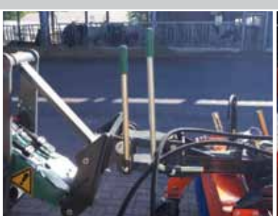
Parallelogram incl. height indicator