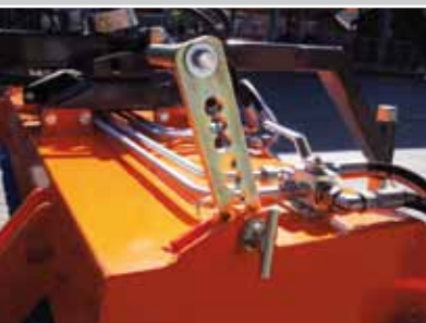
Adjusting-lever system with optimized sweeping-angle